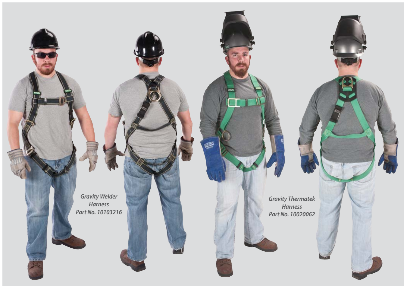
Gravity Welder Harness Part No. 10103216